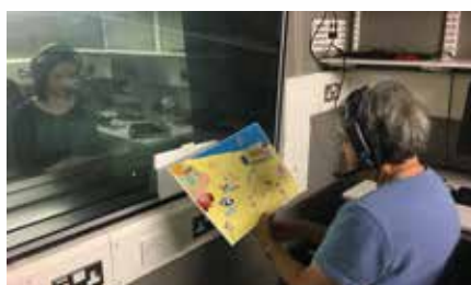
Younger and older adult being recorded while carrying out a 'spot the difference' task

Going forward, the researchers leading the project see their work benefiting a number of areas including speech and language therapy, adult social care and charity sectors, developers of speech technology and also the wider public. This project could extend the understanding of the wider implications of hearing loss in older adults, and lead to developments in communication technologies that will help to address their needs.